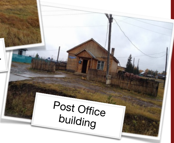
Post Office building