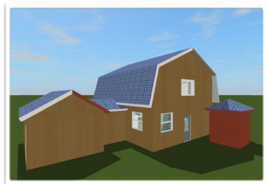
3D Rendering of the Vanavara House back view