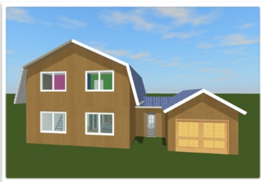
3D Rendering of the Vanavara House front view

After we return back from furlough in May of 2015, we will take several more trips up to Vanavara for the purpose of purchasing land, hooking up electricity, filing for building permits, and setting the stage for our permanent move. We would then return to Krasnoyarsk and purchase several shipping containers, buy the needed building supplies and have everything ready to ship up on the winter road in December of 2015. We would then move up shortly after the new year in January or February of 2016, and be ready to break ground and build both our house and the Dean's house in the spring and summer of 2016.