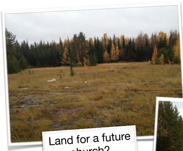
Land for a future church?