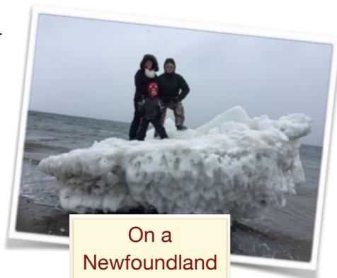
On a Newfoundland iceberg

The Lord also blessed our remaining time in Maine, as we reported back to a number of our supporting churches. It was truly a privilege to share what the Lord has done these past few years. We are thankful for all of you who faithfully hold the ropes for us in prayer and financial support!