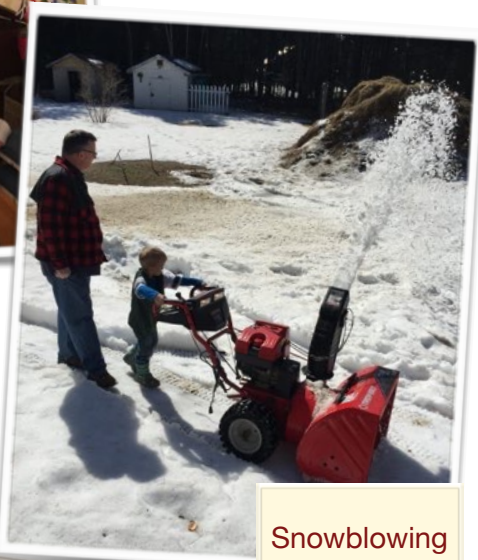
Snowblowing in Maine!