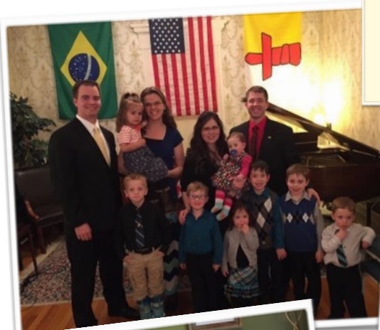
Fellow Arctic missionaries - the Hitz family