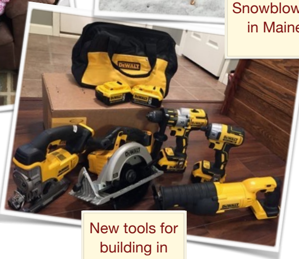
New tools for building in Vanavara!

As always, we truly appreciate your faithful prayers and support of our ministry. We are honored to be your representatives to the people of Siberia.