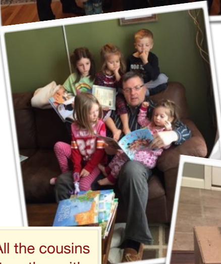
All the cousins together with Bumpa