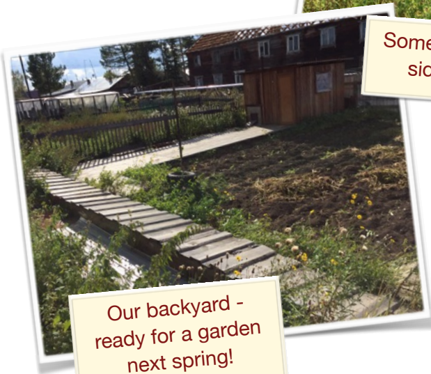
Our backyard - ready for a garden next spring!

As always, we truly appreciate your faithful prayers and support of our ministry. We are honored to be your representatives to the people of Siberia.