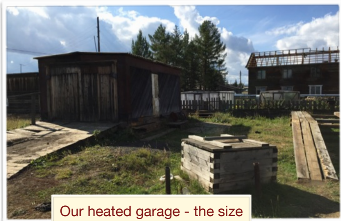
Our heated garage - the size of a small shed