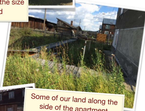
Some of our land along the side of the apartment