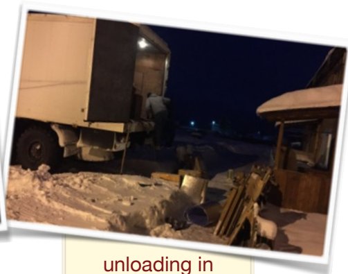
unloading in Vanavara at 4:30 in the afternoon