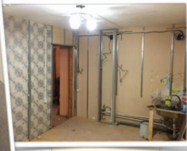
a start on the kitchen