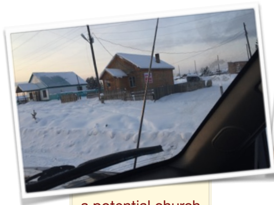
a potential church building for sale