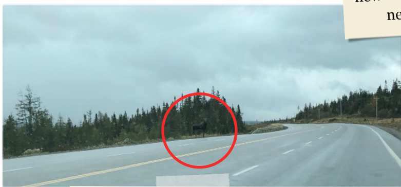
a moose on the road between Stephenville and Corner Brook (prayers for safety are not taken for granted)