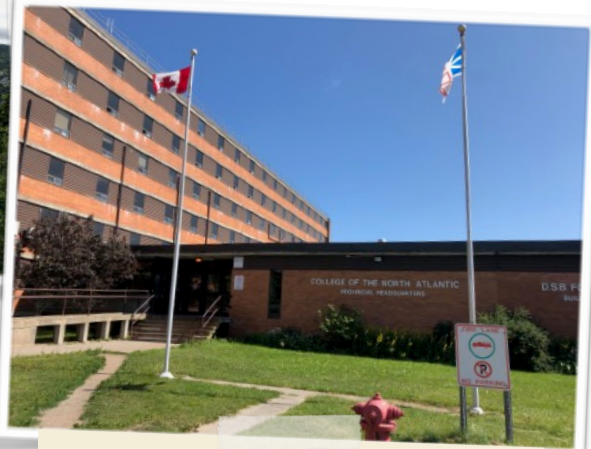
the community college where New Hope Baptist Church meets