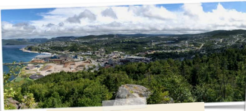
the city of Corner Brook where Grace Baptist Church is located