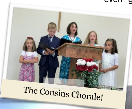
The Cousins Chorale!

Please keep us in prayer as we continue to get settled into life and ministry. We are excited to be here and we look forward to what God will do!