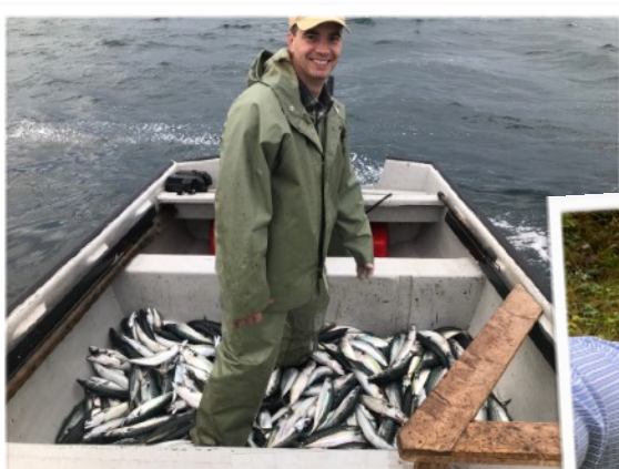
mackerel fishing on the ocean