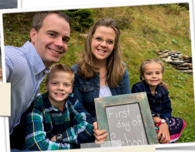
new home, new ministry, new school year