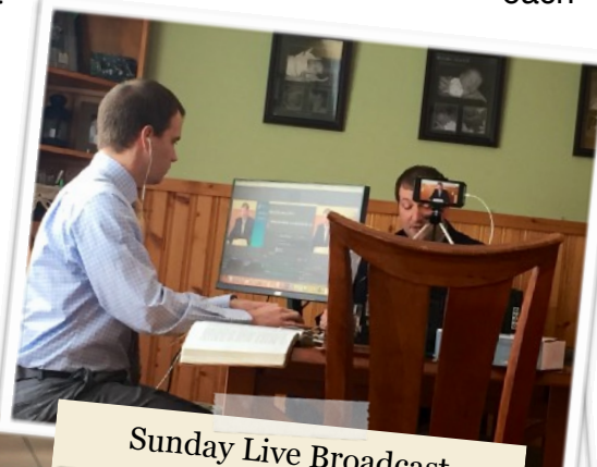
Sunday Live Broadcast

who watch the service will come to the church services when we are allowed to meet again. If you would like to view our church’s Facebook, you can follow us @newhope4stephenville.