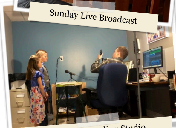
Home Recording Studio