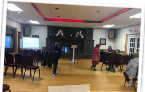
New Hope's temporary meeting place at the curling club