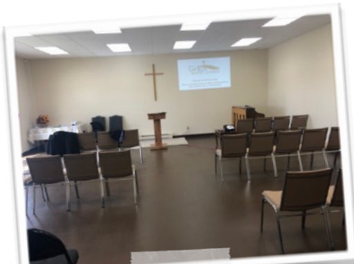
The new floor at Grace

In Corner Brook, Grace Baptist Church had an unexpected blessing when the owners of the storefront that we lease graciously suspended our rent payments for the months that we were unable to hold services. When we reconvened for services in July, we were excited to have several visitors who have been faithfully attending since then. God has brought two families and a single man into our congregation and we are excited about the work that God is doing in Corner Brook. Another praise is that we were able to complete a much-needed project at the church — refinishing the floor. The church people gave sacrificially for the project and we even had several of the church men show up throughout the week to help!