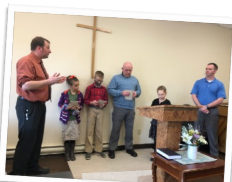
Four followed the Lord in believer’s baptism!