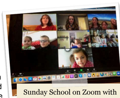
Sunday School on Zoom with both churches

that special day. The church family is excitedly anticipating this next step and we are so thrilled to be a part of God’s work here in western Newfoundland.