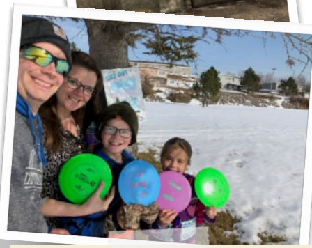
An old military bunker and frisbee golf in the snow!