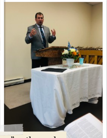
“We Will Follow” — the goal and theme for Grace Baptist Church

“Finally, brethren, pray for us, that the word of the Lord may have free course, and be glorified...”