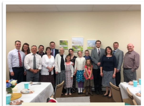
Charter members of Grace Baptist Church