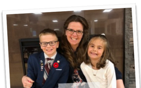
Mother's Day photo

The kids have also started piano lessons during the summer and it has been a joy to listen to them progress already even in such a short time. They are already asking about when they can play in church!