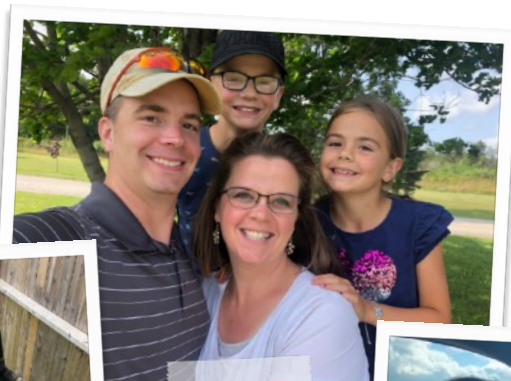
Summertime in NL!

In the midst of all that is already going on, we have also applied for an update and extension to our Visitor Record (visa) to reflect the move to Corner Brook, and we have simultaneously begun the long process of applying for Permanent Residency. We would appreciate your prayers for each of these immigration applications.