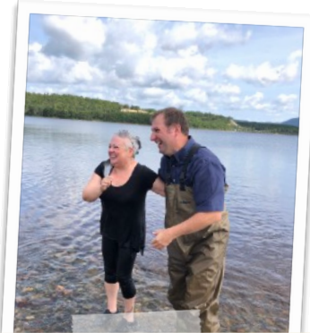
Always a joy to see a new believer baptized!