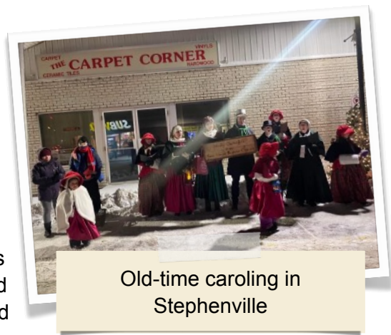
Old-time caroling in Stephenville

The Lord has worked in some special ways as we closed out 2021 and began a new year of ministry in 2022. In December, we were able to take part in two outreaches — one in Corner Brook and one in Stephenville. Our church took part in the annual Christmas parade in Corner Brook and we were able to distribute 1500 packets of Gospel literature and church information. What was especially encouraging was hearing our people so excited about the outreach and wanting to do even more packets for the next time!