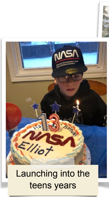
Launching into the teens years

We want to say a special thank you to all of you who sent special gifts and/or cards for Christmas and the kids' birthdays. It means a lot to us as parents to see the love that you pour out on our kids (and us). Thank you for demonstrating your love and care for us in this way.