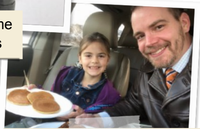
Birthday breakfast treat!