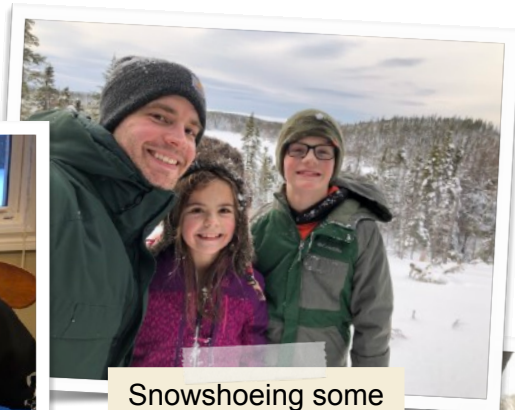
Snowshoeing some of the back trails