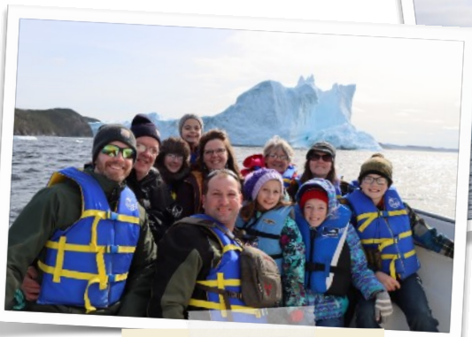
Family outing to see the iceberg