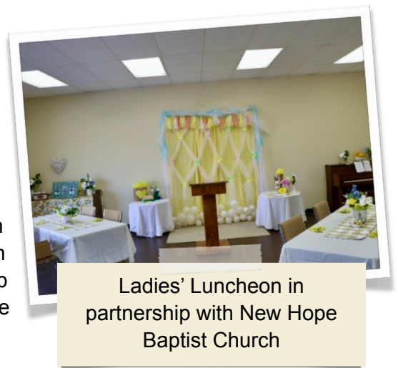
Ladies' Luncheon in partnership with New Hope Baptist Church