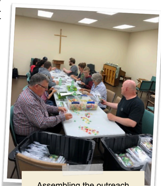
Assembling the outreach packets for Corner Brook

Probably the most exciting ministry opportunity has come just in the last couple of weeks. We were made aware of several Ukrainian refugee families who have resettled in Corner Brook, and we have been able to work with one family specifically to provide translation services and help them navigate documents and immigration requirements. We have been able to have them in our home for a visit, gone with them to help translate at medical appointments, helped them find and purchase a vehicle, and many other things that have been needed. It is amazing to see how God has prepared us and placed us in Corner Brook to be able to help in this way. Although our Russian is a bit rusty after not using it for almost 4 years, God has given grace and understanding and the words that we've needed. After the first day of being with this