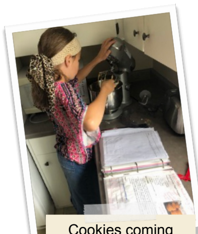
Cookies coming right up!

Thank you for your faithful prayers and support. We are truly blessed to be His servants and your representatives to the people of Newfoundland.