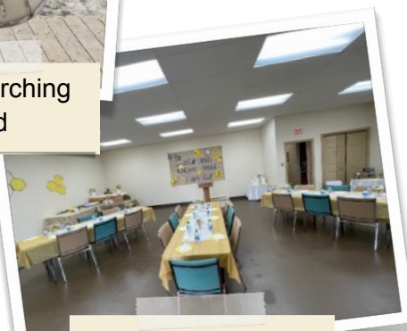
Ladies' Luncheon 2023