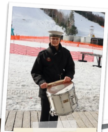
Cadet marching band