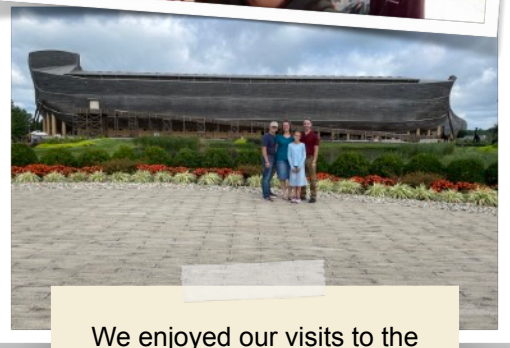
We enjoyed our visits to the Creation Museum and the Ark Encounter in Kentucky