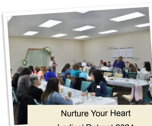
Nurture Your Heart Ladies’ Retreat 2024