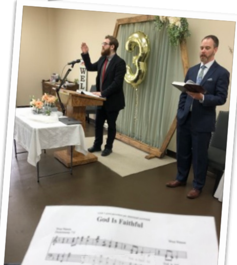
Celebrating 3 years of God’s faithfulness at Grace Baptist Church