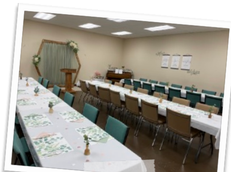
Katie did a wonderful job decorating for the Ladies' Retreat