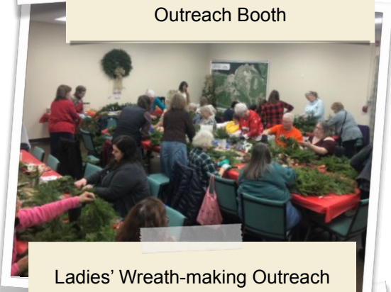
Ladies' Wreath-making Outreach