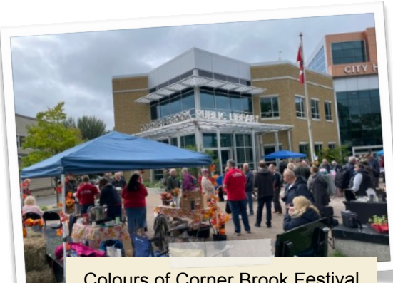
Colours of Corner Brook Festival Outreach Booth

We continue to be amazed at what God allows our small church to do in our community. We have done more outreach this year than any other year to date, and we are praying that the Lord will use our efforts to open doors of ministry to individuals in our community and see people saved.